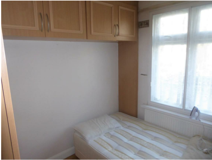
Front aspect double glazed window, radiator, built-in wardrobe and over bed recess.