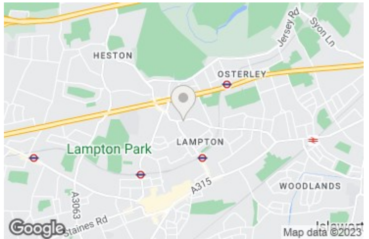
Laid to lawn area.