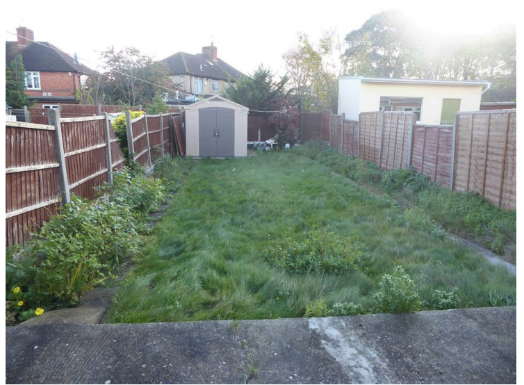
Concrete area, rest laid to lawn, storage shed.