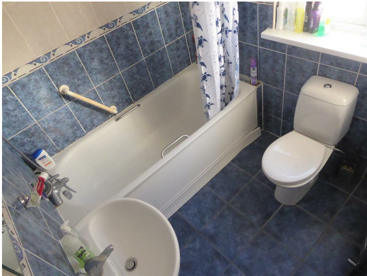
White suite comprising panel enclosed bath, pedestal wash hand basin, low level w/c, tiled walls and flooring.